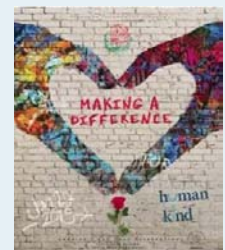
2018 Rose Parade Theme

This is not a project of Rotary International