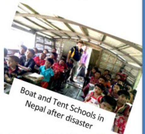
Boat and Tent Schools in Nepal after disaster

Do you want to earmark unused District Designated Funds and/or Cash for Service Projects that result in Peace Through Service?