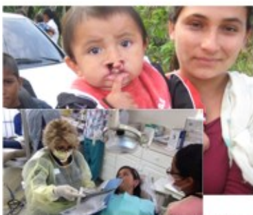
Cleft Palate and Dental work in Mexico and Guatemala