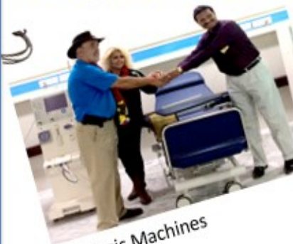
Dialysis Machines in India

Do you want to earmark unused District Designated Funds and/or Cash for Service Projects that result in Peace Through Service?