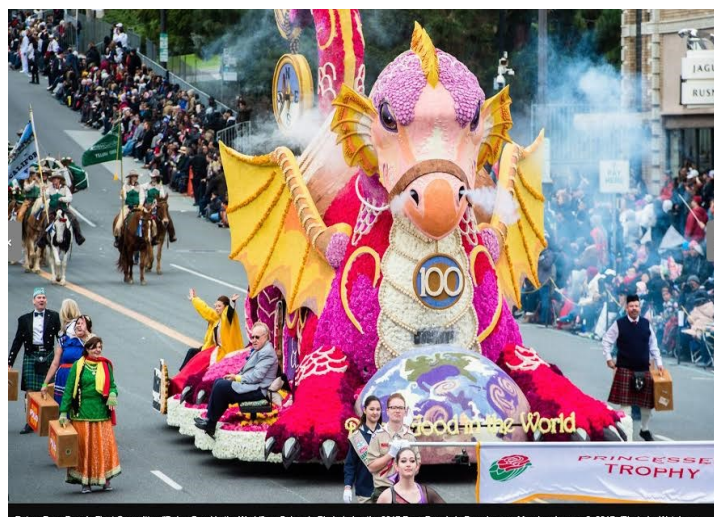
2017—90 years later